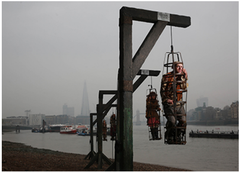
Pirates are gibbeted along infamous Execution Dock in the first scene of its kind in nearly 200 years

The swinging buccaneers mark the launch of epic pirate drama Black Sails in the UK, available from today on Amazon Prime Instant Video